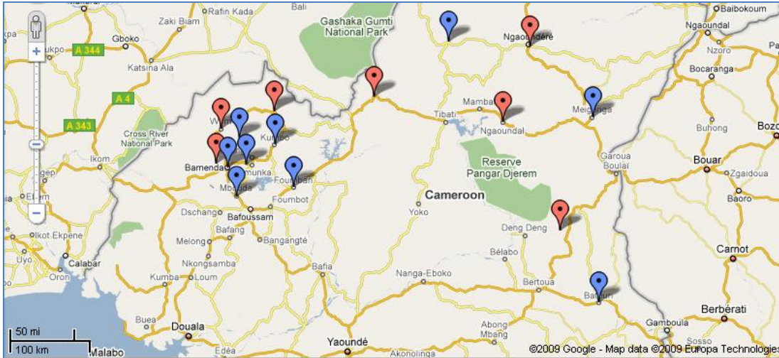
Figure 1: A Google map of Cameroon with the seropositive divisions marked with orange balloons and the seronegative divisions marked in blue